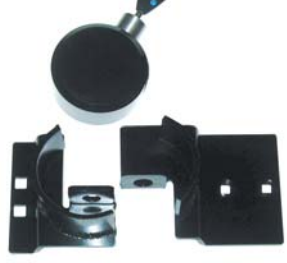
ABLOY Puck Hasp & Puck Lock

The ABLOY<sup>®</sup> Shut-out Hasp (PL299) and Puck Hasp (PL700) are made of cold-rolled steel with electro-plated black finish to visually blend in with the physical appearance of vending machines. The hasps are designed to restrict prying and exterior access to the bill accepter. The covered portion of the hasp protects the concealed shack